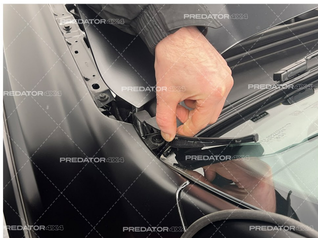
7. Remove the corner section of the scuttle panel and feed the cable underneath.