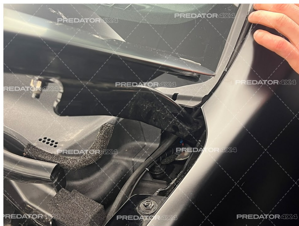
8. Re-install the corner piece of the scuttle panel.