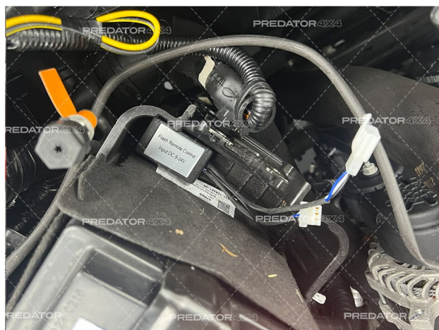
9. Use strong double sided tape to secure the wireless control fob to battery tray.