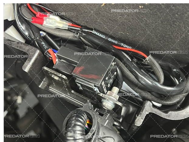
11. Mount the relay on the bracket to the side of the battery this allows the wireless receiver to be easily connected.