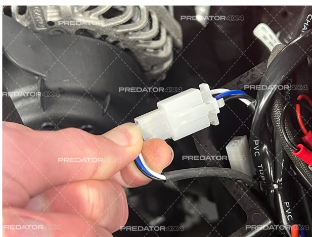
12. Step 11 continued - Connect the wireless receiver to the relay using the white male and female plug.