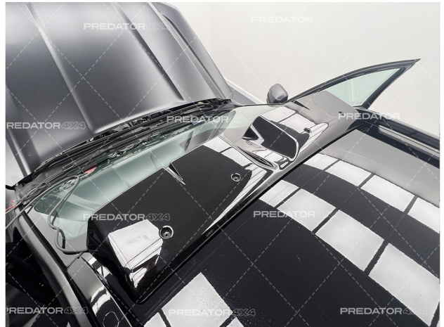
4. Secure the cover to the base using the supplied installation hardware.