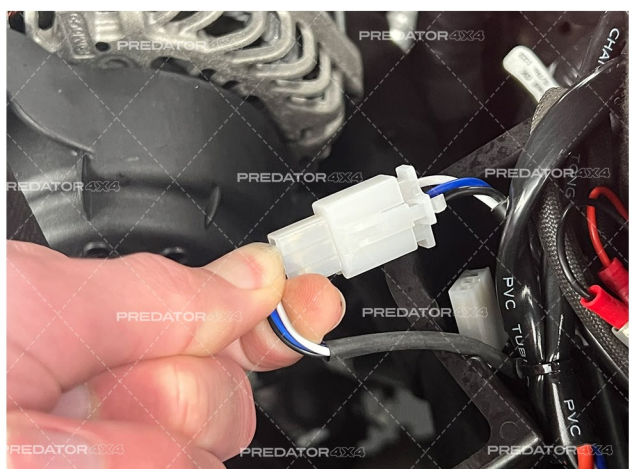
12. Step 11 continued - Connect the wireless receiver to the relay using the white male and female plug.