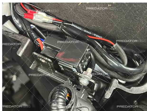
11. Mount the relay on the bracket to the side of the battery this allows the wireless receiver to be easily connected.