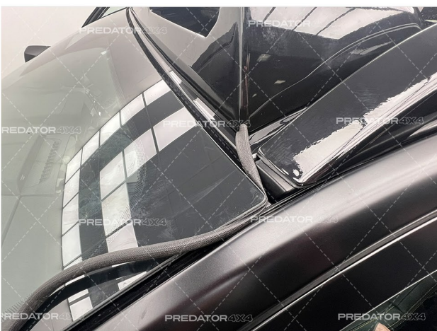
5. Feed the power cable from the corner of the roof light and behind the upper corner of the windscreen.