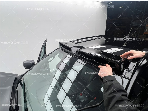
3. Place the top cover over the lights and base.