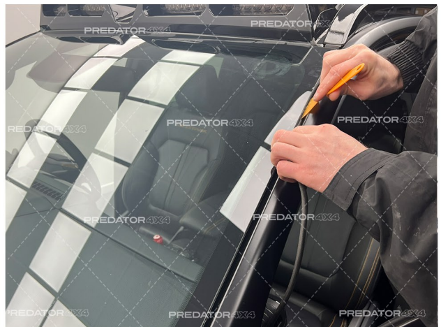
6. Use a trim tool or credit card to push the cable under the edge of the windscreen.