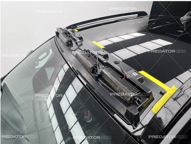
1. Install 4x LED lights into position on the roof light base, this can be done off the car.