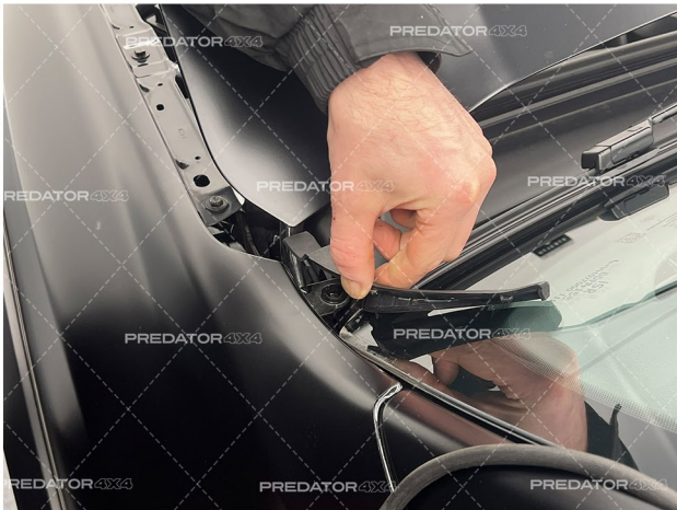
7. Remove the corner section of the scuttle panel and feed the cable underneath.