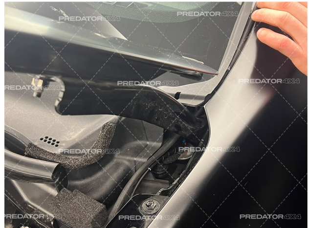
8. Re-install the corner piece of the scuttle panel.