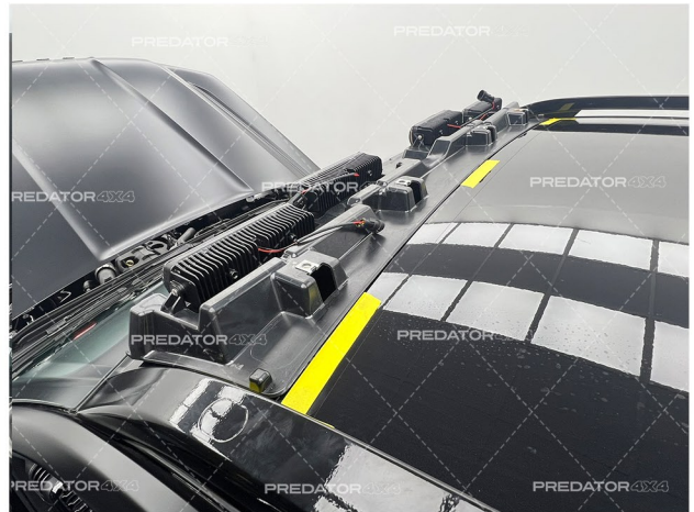
2. Use strong double sided tape or adhesive such as Tiger Seal to mount the base into position on the roof.