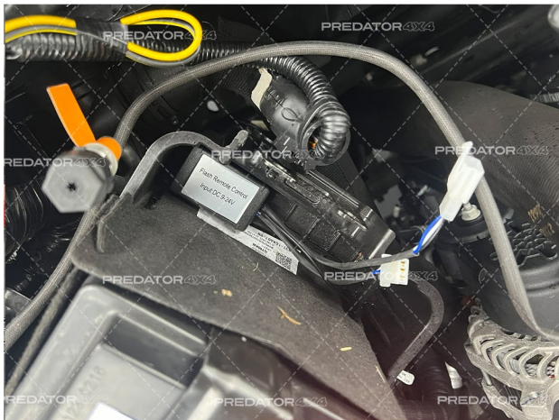
9. Use strong double sided tape to secure the wireless control fob to battery tray.