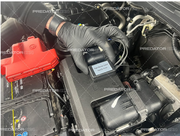
9. Use strong double sided tape to secure the wireless control fob to the top of the fuse box.