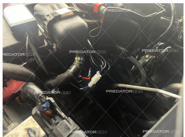
12. Step 11 continued - Connect the wireless receiver to the relay using the white male and female plug.