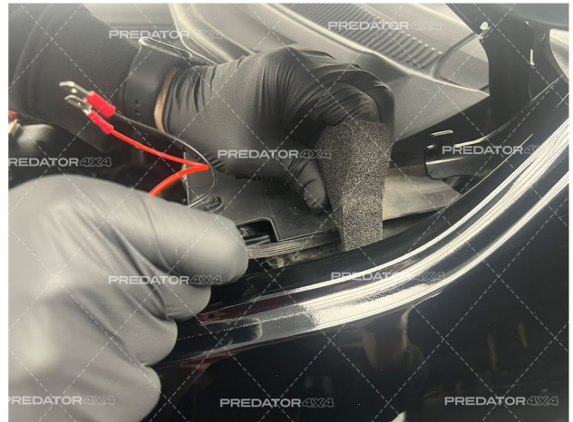
8. Re-install the corner piece of the scuttle panel.