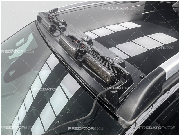
1. Install 4x LED lights into position on the roof light base, this can be done off the car.