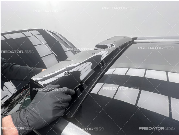
3. Place the top cover over the lights and base.