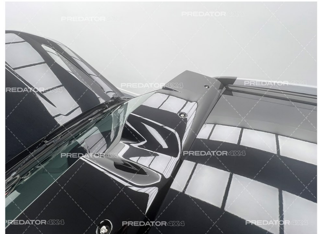
4. Secure the cover to the base using the supplied installation hardware.