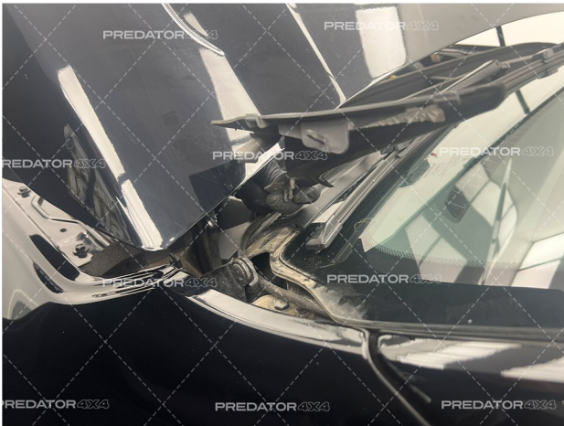
7. Remove the corner section of the scuttle panel and feed the cable underneath.