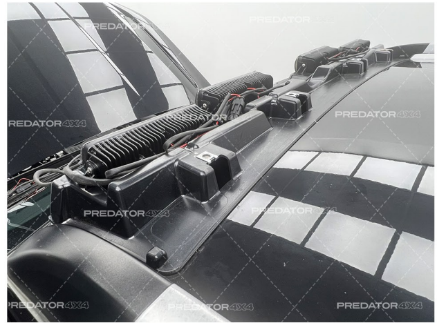
2. Use strong double sided tape or adhesive such as Tiger Seal to mount the base into position on the roof.