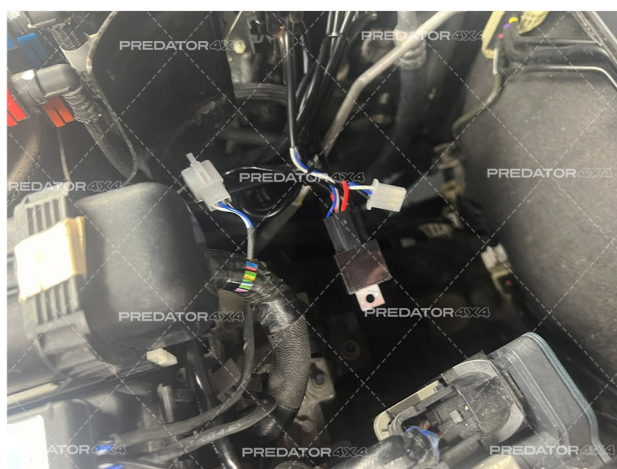
11. Mount the relay in a suitable position in the engine bay, close enough to the wireless receiver to allow them to be connected.