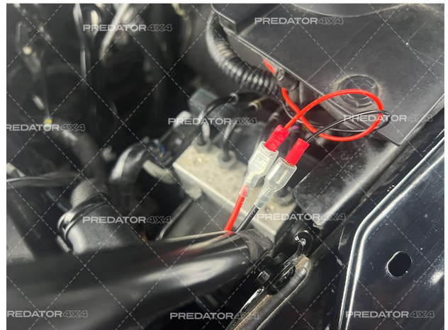
10. Connect the roof light wires to the battery harness.