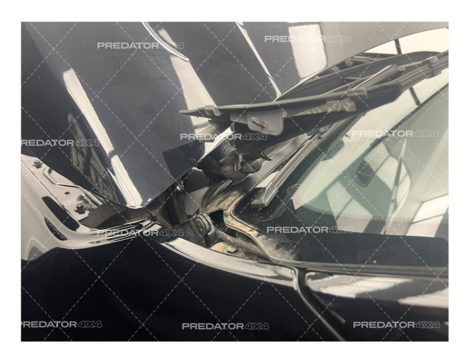
7. Remove the corner section of the scuttle panel and feed the cable underneath.