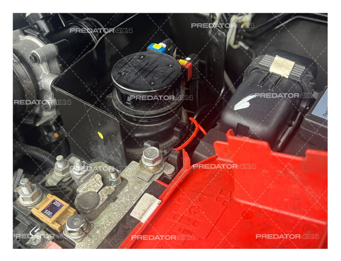
13. Connect the red wire on the battery harness to the positive terminal on the battery.