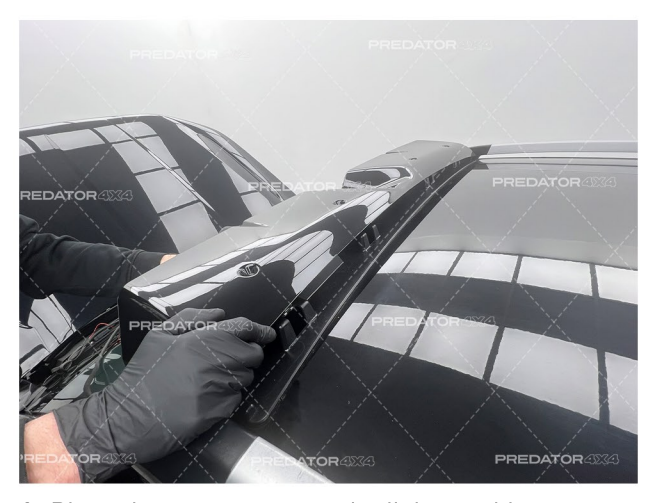
3. Place the top cover over the lights and base.