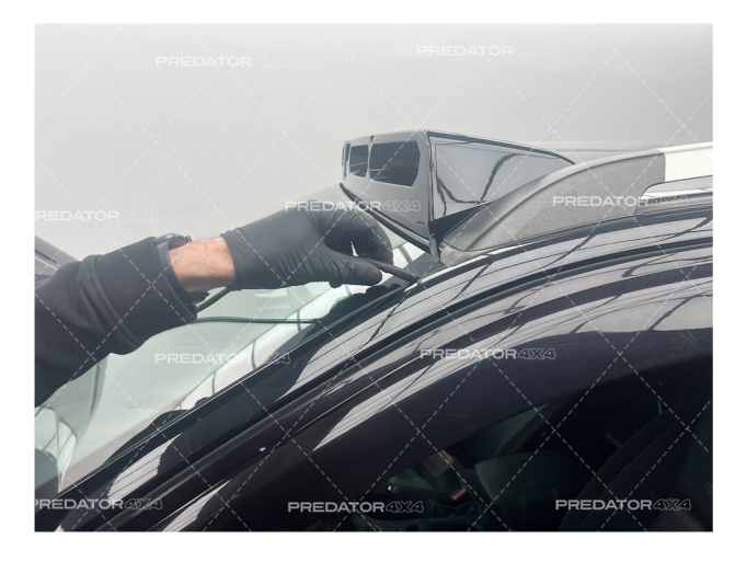
5. Feed the power cable from the corner of the roof light and behind the upper corner of the windscreen.