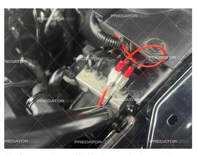
10. Connect the roof light wires to the battery harness.