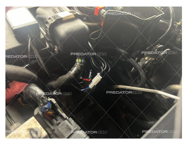
12. Step 11 continued - Connect the wireless receiver to the relay using the white male and female plug.