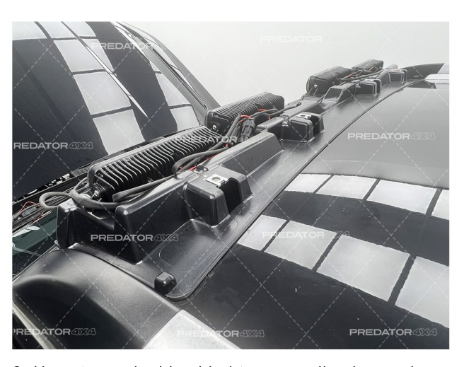
2. Use strong double sided tape or adhesive such as Tiger Seal to mount the base into position on the roof.