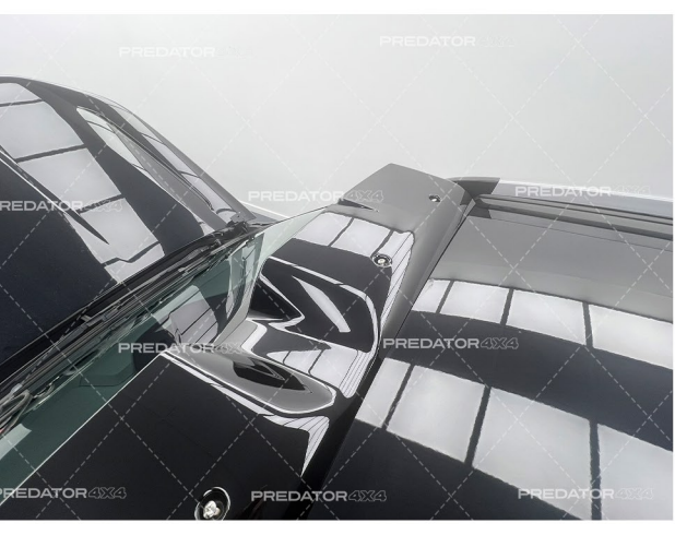
4. Secure the cover to the base using the supplied installation hardware.