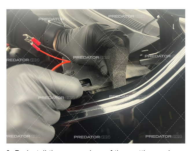
8. Re-install the corner piece of the scuttle panel.