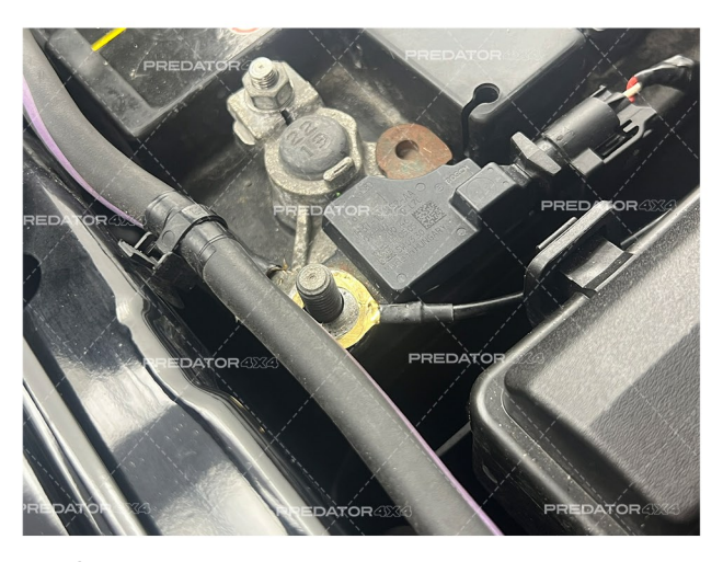
14. Connect the black wire on the battery harness to the negative terminal on the battery or an appropriate earth point on the vehicles chassis.