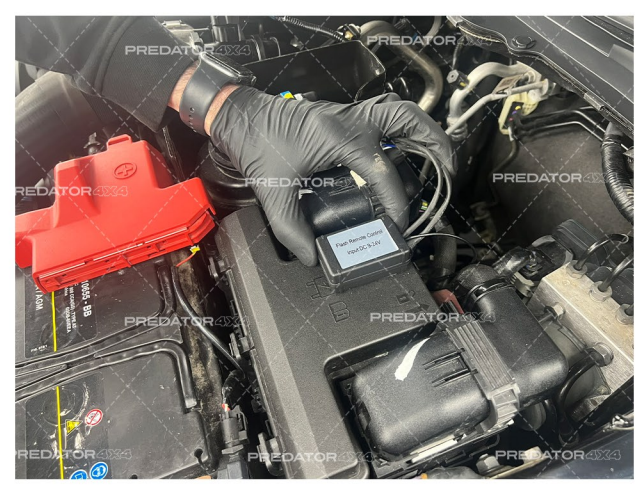
9. Use strong double sided tape to secure the wireless control fob to the top of the fuse box.