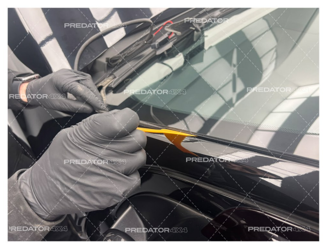
6. Use a trim tool or credit card to push the cable under the edge of the windscreen.