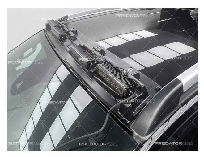
1. Install 4x LED lights into position on the roof light base, this can be done off the car.